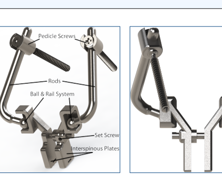
Figure 1 Isometric View of Design Rendered in Solidworks